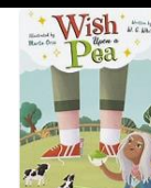
Wish Upon a Pea WG White