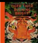
Tiger, Tiger Burning Bright Fiona Waters