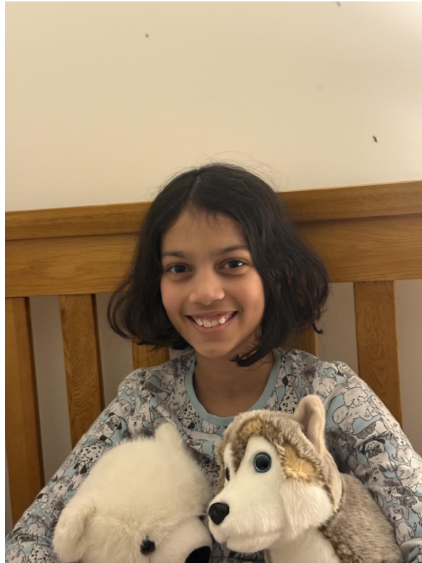
2 - After!