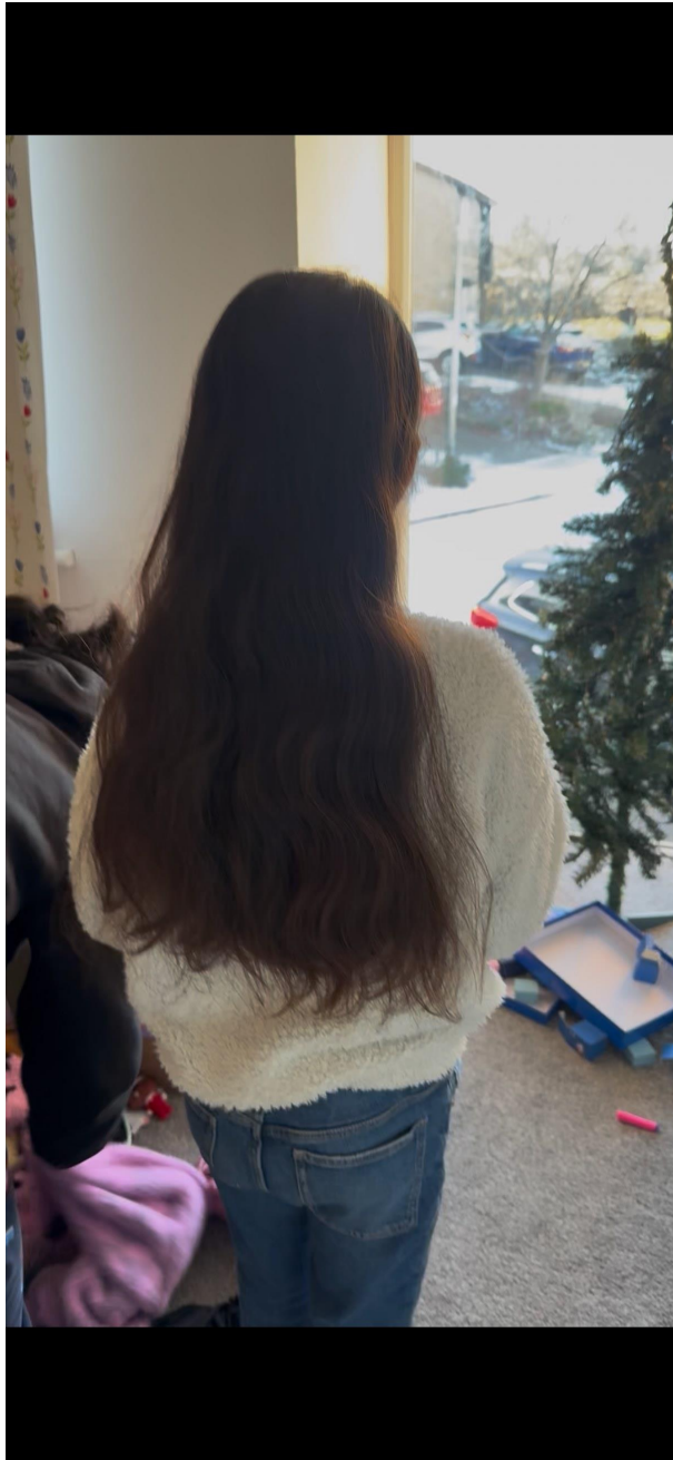
1 - Before...